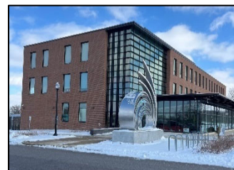
Wooster Science Building