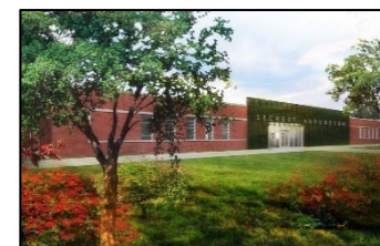
Secrest Welcome & Education Center