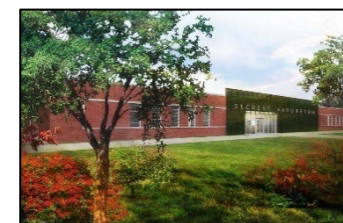
Secrest Welcome & Education Center