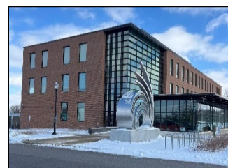
Wooster Science Building